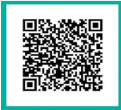
SCAN THIS FROM YOUR BANK MOBILE APP